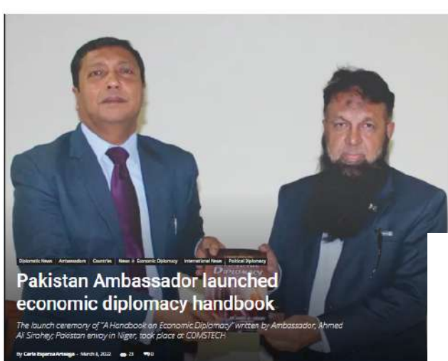
Pakistan Ambassador launched economic diplomacy handbook