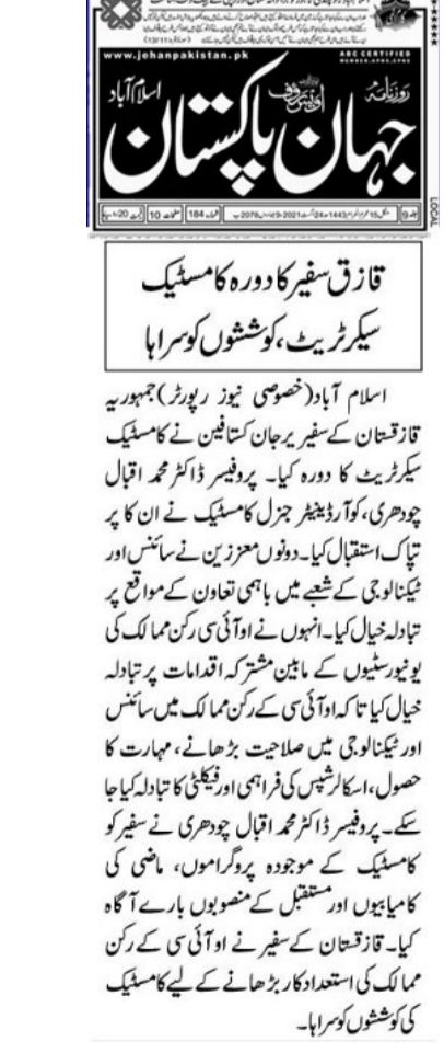
قازق سفیر کا کامسٹیک سیکرٹریٹ کا دورہ